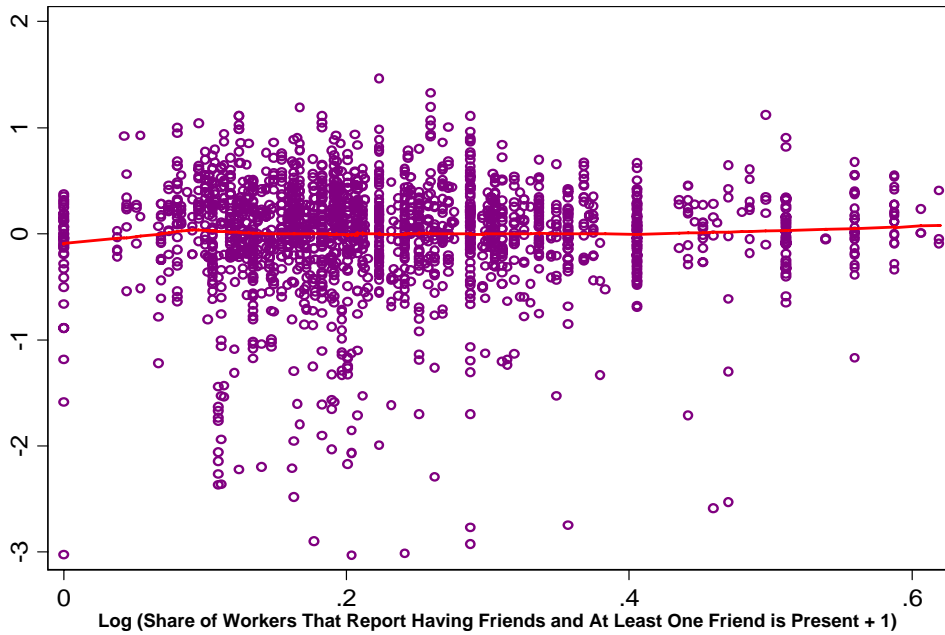
Figure 1B: The Elasticity of Worker Productivity With Respect to the Share of Workers That Report Having Friends and At Least One of Their Friends is Present